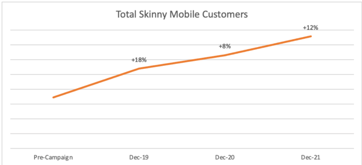
Figure 1 = Internal Skinny Sales Data

Whatever campaign we developed would need to deliver customer growth for Skinny. Between 2019 and 2021, we grew the base on average by 12% each year. Our objective for this campaign was to see growth greater than 12%.